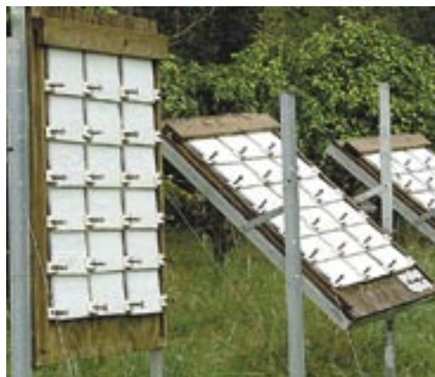
LP SmartSide siding placed on 45- and 90-degree walls for accelerated performance testing.

90-degree angle wall – and helped show how LP SmartSide siding would perform over the long term. To date, we've been testing for nearly