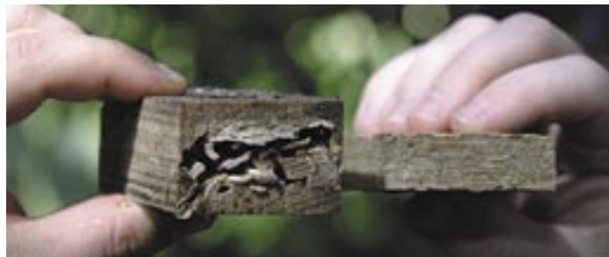
Untreated wood devastated by Formosan termites (left) and undamaged LP SmartSide product protected with SmartGuard® (right) during same testing period.

Still not satisfied, we put LP SmartSide siding to the ultimate test – exposure to Formosan termites. Each sample was placed on a plastic grid, surrounded by untreated bait samples and placed directly on top of Formosan termite colonies, home to millions of termites. When we examined the samples every six months for three years, the bait samples were completely destroyed, while the LP SmartSide siding showed no structural damage. Now that's what we call proven protection!